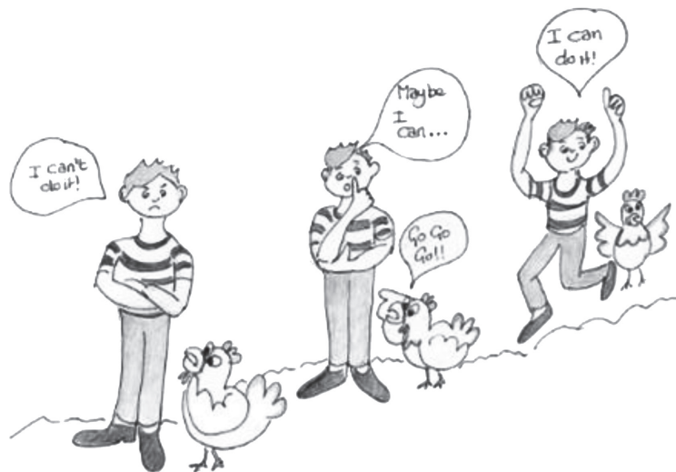
Figure 7.3 The continuum of self-efficacy

It is important to remember that we are not born with a level of self-efficacy that we maintain throughout our lives. Developing a strong sense of self-efficacy is something we can enhance with practice and the resilient teacher is the one who learns how to do this. Think of it as a continuum where you might start with a weak sense of self-efficacy but, through learning different ways of thinking and approaching tasks, you move through the continuum until you achieve the outcome you want.