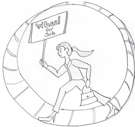
Figure 7.4 The hamster wheel

There are four key elements to emotional intelligence: