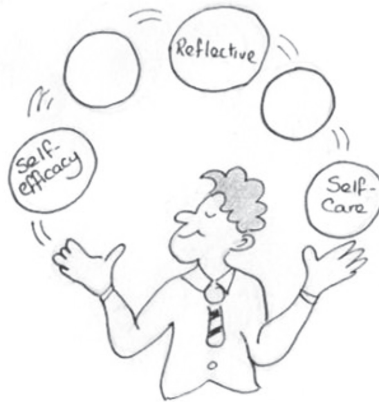
Figure 7.1 The resilient teacher