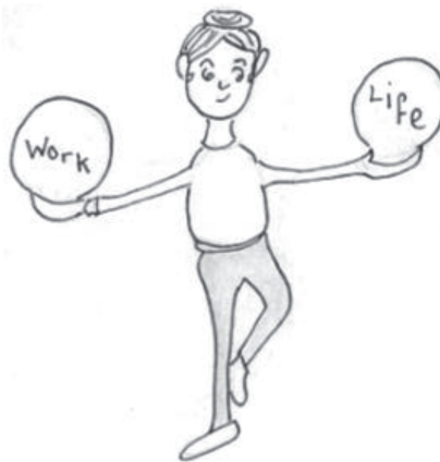
Figure 7.7 Work-life balance

Learning to become a teacher may be one of the most rewarding things you do. It is an emotional journey but also a very rewarding one. You will develop a lot of skills and learn new things, many of them about yourself. It is important that you make the most of the opportunity but it is also important to remember that this is not all there is. Other aspects of your life are what make you the person you are and in turn those interests and passions will make you a better teacher. Teaching can enhance your life and your life can enhance your teaching so it is very important that you make time for it. Some of the advice in this and other chapters will help you to organise your time more