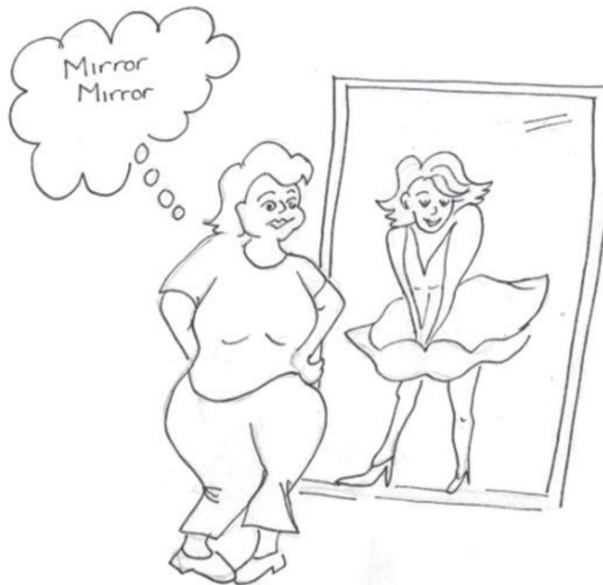
Figure 7.6 Mirror, mirror