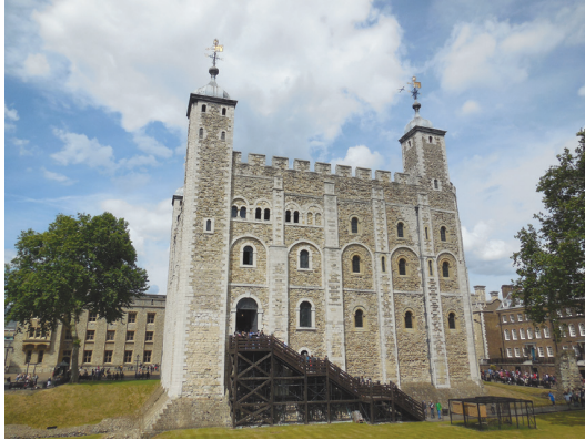
Photo 2.1 The infamous White Tower inside the Tower of London complex.

There are few international iconic prison images as prominent as that of the Tower of London, located on the River Thames in the center of London, England. Begun after 1066, when William the Conqueror captured the Saxon city of London in the Norman invasion, the centerpiece of this castle complex, the White Tower, was completed in roughly 1080 (Impey & Parnell, 2011). The Tower of London today has a number of buildings, including the White Tower, along with several towers and gates on its double walls. At one time, it included a moat, which has since been filled in. Sited in old London, today it is surrounded by modern buildings and near-ancient structures alike. Over the centuries, it has been added to by various kings and used to defend the city, as a royal palace and a symbol of power for royalty, as a mint for royal coinage, as an armory, as a treasury for the royal jewels, as a conservator of the King's Court's records, as a kind of zoo for exotic animals gifted to the royalty, as a tourist attraction for centuries, and, for our purposes, as a prison and a place of execution.