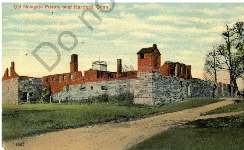
Photo 2.5 Newgate Prison, a working copper mine, served as an early colonial prison.

Newgate Prison (Simsbury, Connecticut): An early colonial prison (1773–1827) that started as a copper mine. Many of its inmates would work the mine during the day and sleep in it at night. During the Revolutionary War, some Loyalists to the English Crown were held here.