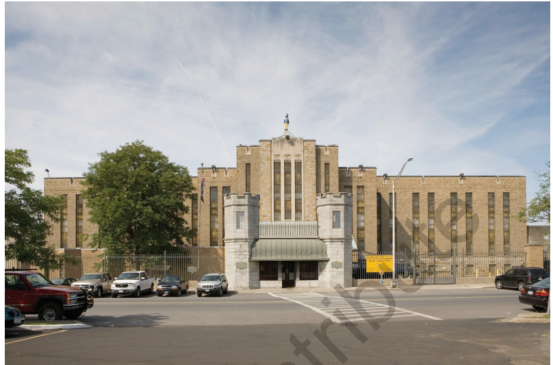
Photo 2.8 Auburn Prison, officially opened in 1818, is still in operation today, though its name has changed to Auburn Correctional Institution.