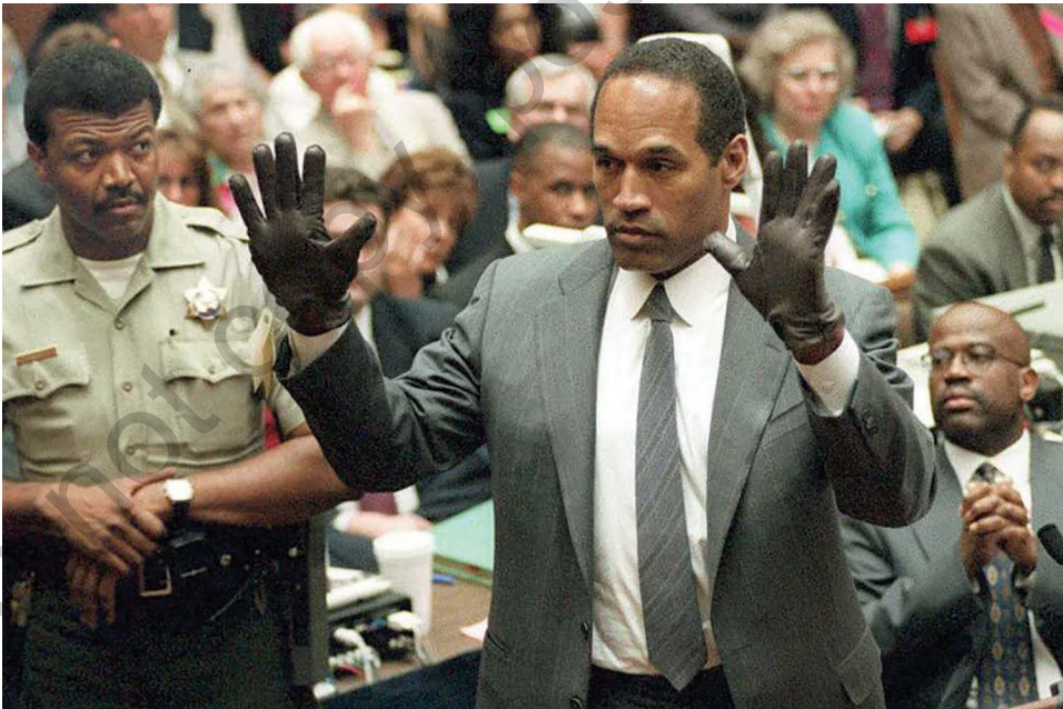
PHOTO 1.1 O.J. Simpson shows the jury a new pair of Aris extra-large gloves, similar to the gloves found at the Bundy and Rockingham crime scene on 21 June 1995, during his double-murder trial in Los Angeles, CA.

Guilt isn’t the only decision that is made in criminal cases. Judges make many decisions before trial, during trial, and after trial. Each decision requires one of the parties, either the defendant or the state, to prove its position by a certain level of confidence. Rarely does the beyond a reasonable doubt standard apply in these decisions. Rather, lesser standards of confidence are required. Preponderance of the evidence, which you already learned applies in civil law cases, is common. Another standard, clear and convincing evidence , is used in a few, specific cases. As an example, the Eighth Amendment to the Constitution of the United States entitles a defendant to be released from jail pending trial, subject to posting money (bail) to ensure