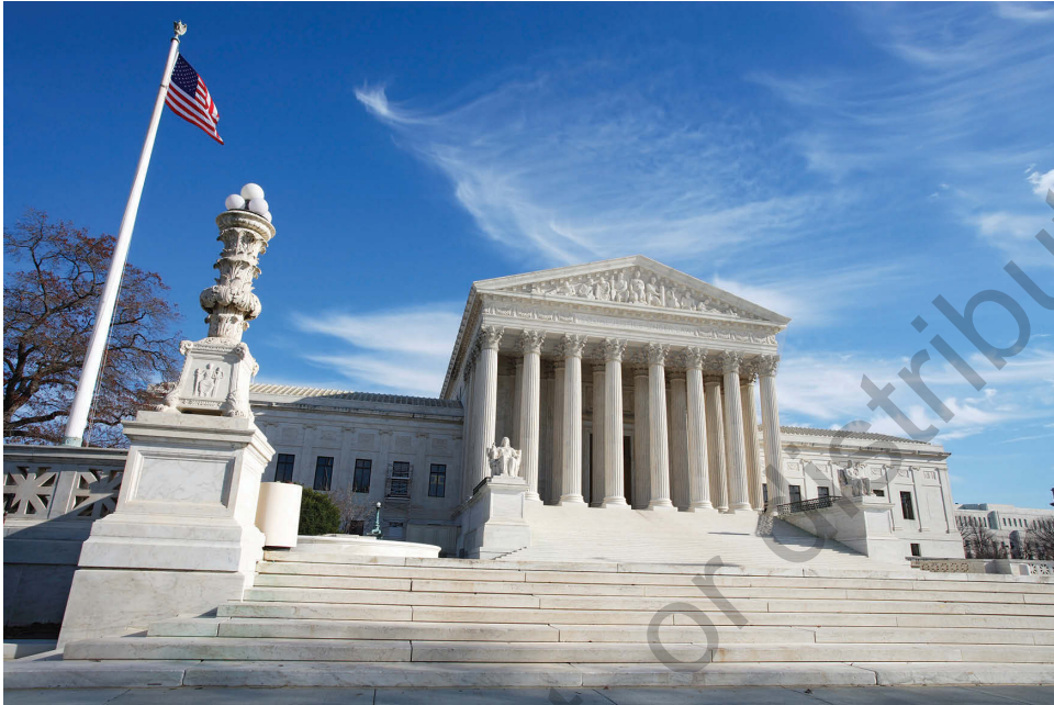
PHOTO 1.3 The United States Supreme Court Building, also referred to as “the Marble Palace,” houses the Supreme Court of the United States.