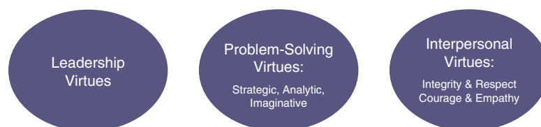
Figure 0.2 A Taxonomy of Virtues

Analytic virtues are apparent in leaders who are motivated to test rather than assume the validity of their own and others’ key beliefs, who are skilled in doing so, and who can explain why such testing is important to them. Virtuous leaders are very aware of the ethical dimensions of their decision-making—that mistaken assumptions and taken-for-granted beliefs can produce poor-quality decisions that waste resources, do not solve the problem, and may have negative impacts on students. The stance of leaders with strong analytic virtues is that of truth-seeking rather than truth-claiming.