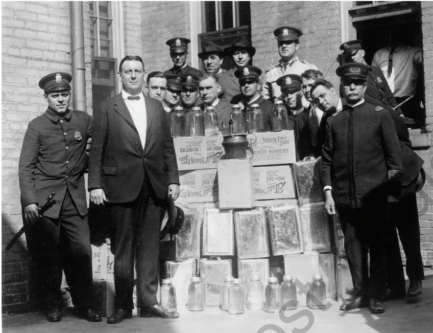
PHOTO 1.1 Group portrait of a police department liquor squad posing with cases of confiscated alcohol and distilling equipment during Prohibition.

hijacked instead of herds of live cattle. Post–Civil War gangs of Wild West robbers such as those of Doc Holliday, Jesse James, the Daltons, Black Bart, the Younger brothers, and Butch Cassidy disappeared with the settlement of the frontier only to reappear on wheels during the Depression of the 1930s in the persons of such infamous characters as John Dillinger, “Pretty Boy” Floyd, the Barrows, Bonnie Parker, and the Ma Barker gang. Mobile, organized gangs of bank robbers have largely faded into a quaint, unsavory history; they are now replaced by cybercriminals who can commit global electronic robbery.