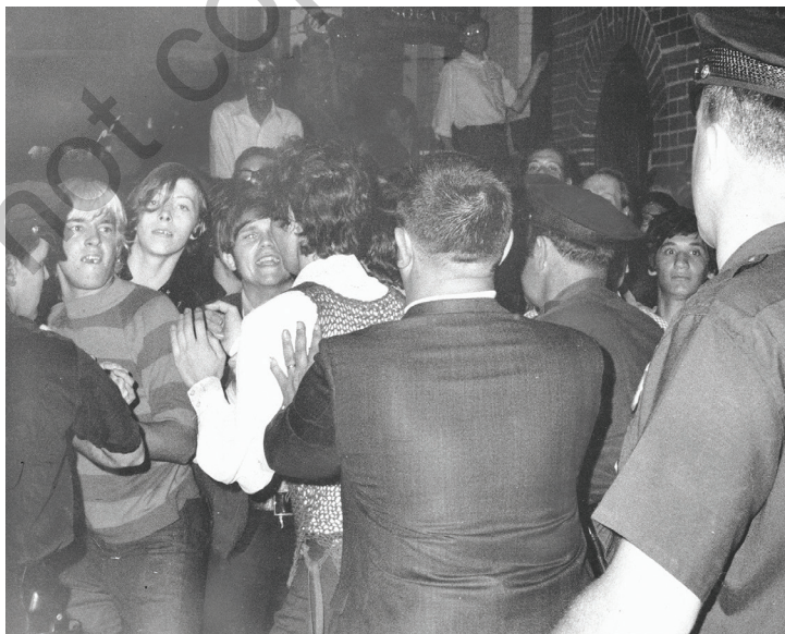
PHOTO 1.2 Police raiding the Stonewall Inn on Christopher Street in Greenwich Village on June 28, 1969, illustrates the overcriminalization of sexual conduct prevalent at the time.

Criminologists make the distinction between acts mala prohibita and acts mala in se . Acts that are defined as mala prohibita refer to those that are bad because they have been prohibited. That is, such acts are not viewed as bad in themselves but are violations because the law defines them as such. Traffic violations, gambling, and infractions of various municipal ordinances might serve as examples. Such laws are viewed as assisting human groups in making life more predictable and orderly, but disobedience carries little stigma other than (usually) fines. The criminalization of such acts might be viewed as institutionalization of folkways. On the other hand, acts mala in se are acts that are bad in themselves, forbidden behaviors for which there is widescale consensus on the mores for prohibition. The universality of laws against murder, rape, assault, and the like, irrespective of political or economic systems, bears witness to the lack of societal conflict in institutionalizing such laws. One can note that not all deviant acts are criminal, nor are all criminal acts necessarily deviant, assuming that laws against many acts mala prohibita are commonly violated.