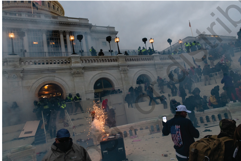
PHOTO 1.4 Domestic terrorist supporters of ex-President Trump storm the U.S. Capitol building. The events of January 6, 2021, would be a good candidate for one of the “crimes of the twenty-first century.”