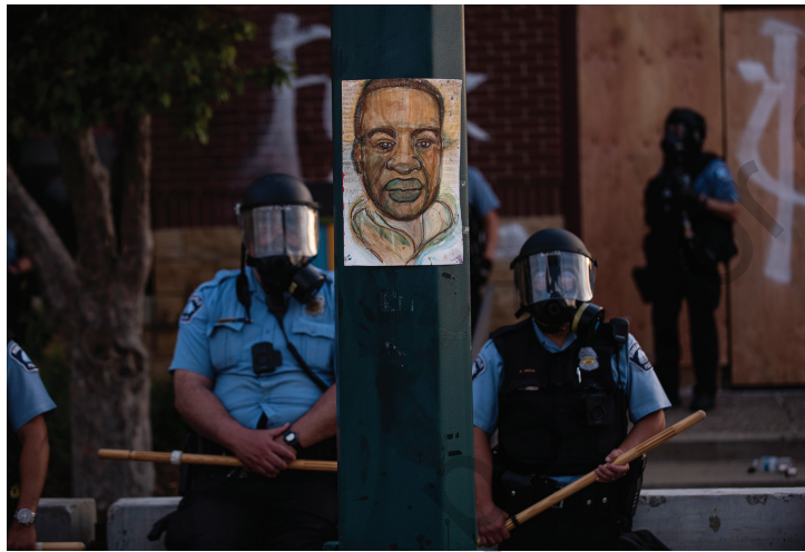
PHOTO 1.5 George Floyd's death at the hands of police in Minneapolis set off massive protests against police brutality and racism. Floyd was murdered during an arrest by police officer Derek Chauvin, who knelt on Floyd's neck for 9 minutes and 29 seconds as three other officers looked on and prevented others from intervening.

It is difficult, if not impossible, to measure the economic costs of crime . Estimates of the actual financial operation take us into the “megabucks” range where notions such as “give or take a few billion dollars” stagger the imagination and numb us to the reality of the amounts we are really talking about.