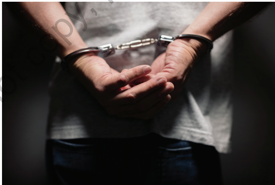
A justice-involved youth under arrest. How do most juveniles enter the system?

Reports of criminal offending rates were erratic and unreliable for decades until jurisdictions began to formalize reporting procedures. Authorities in Maine, Massachusetts, and New York were the first to collect official crime statistics. Other states and localities attempted to publish crime rates, but the information was not valid enough to determine the actual crime level. In other words,