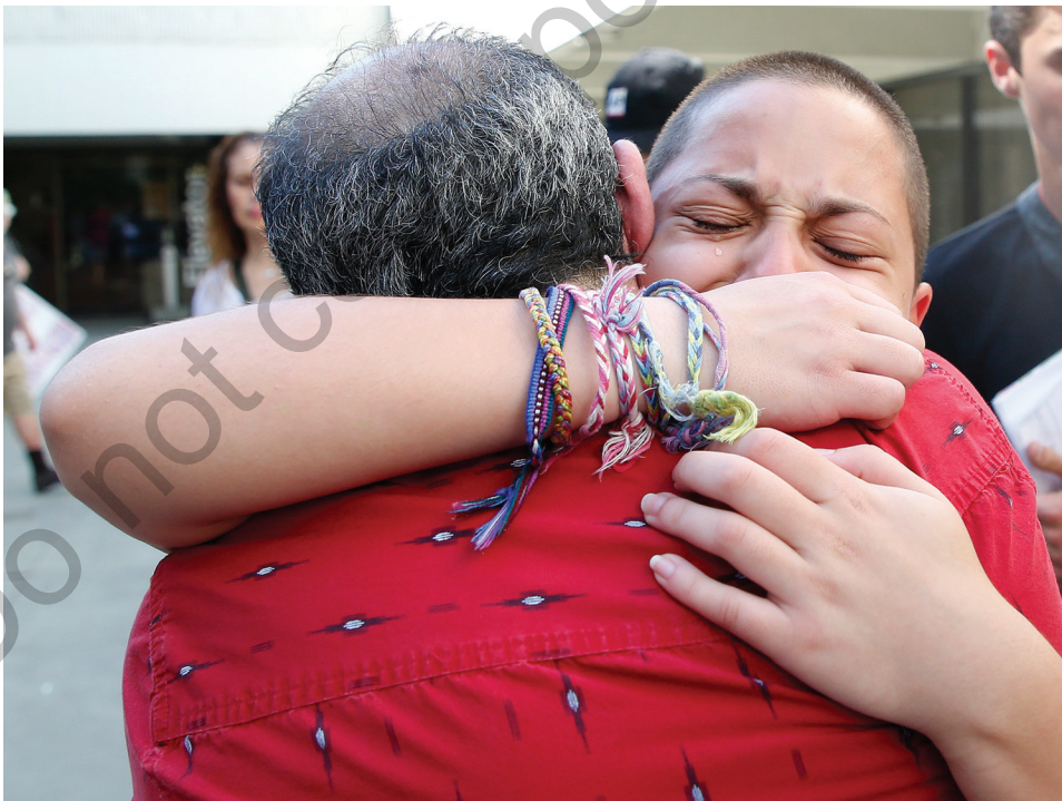
A parent hugs his child following a school shooting. Why is school violence so common today?

The NCVS surveys almost 135,000 households and 224,520 individuals ages 12 and older on their experiences with crime victimization, including rape, robbery, assault, and domestic violence (see Figure 2.3). 27 Each household was interviewed in 2019 and 2020. The study projected that this population experienced a decrease in violent victimization from 21.0 victimizations in 2019 to 16.4 victimizations in 2020 (per 1,000 persons). It is especially notable that the rate of violent victimization against persons under the age of 18 declined 51% between 2019 and