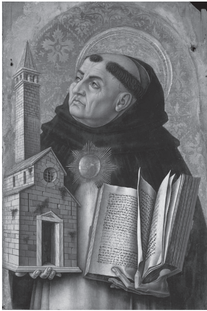
Saint Thomas Aquinas (1225–1274) was an Italian Dominican friar and priest who in Summa Theologiae , written between 1265 and 1274, articulated a comprehensive religious statement of natural law.