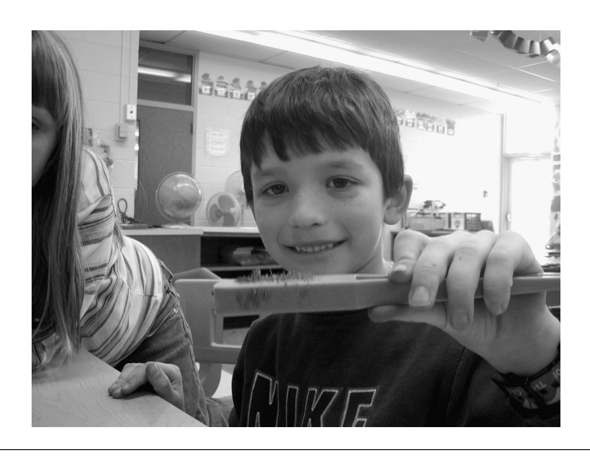
Photo 1.2Experiencing MagnetismStudents construct knowledge about magnets.

In some sense, the activity itself does not make something constructivist or not. However, the order of events does matter within constructivist learning structures. Why might this be the case? Note the difference between a lesson in which the teacher gives the students a set of wires, a battery, and some lightbulbs and teaches them how to put these together to light the bulb versus a lesson in which the teacher gives the students a set of wires, a battery, and some lightbulbs and asks them how many different ways there are to get the bulb to light. The activity is the same, the materials are the same, but the order is different. How? In the first lesson, the students are given the procedure and then asked to repeat it. In the second lesson, students are asked to experience the physical and mindful manipulation before they are asked to understand it.