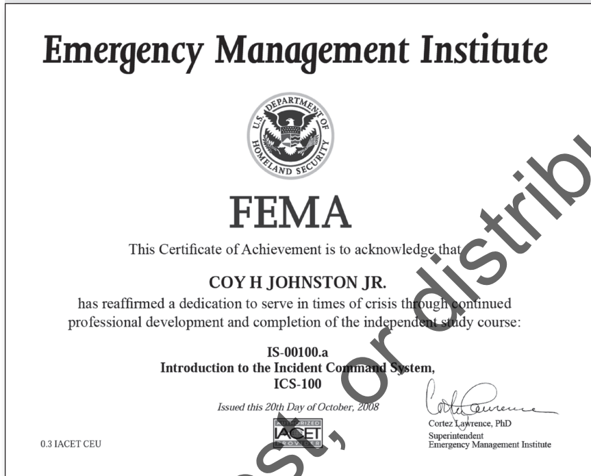
Figure 10.1 Sample FEMA Training Certificate